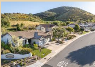
Dos Vientos Ranch