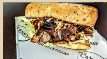
West of Orleans