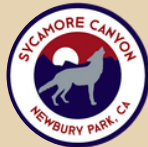
Sycamore Canyon School