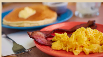
Country Harvest Restaurant